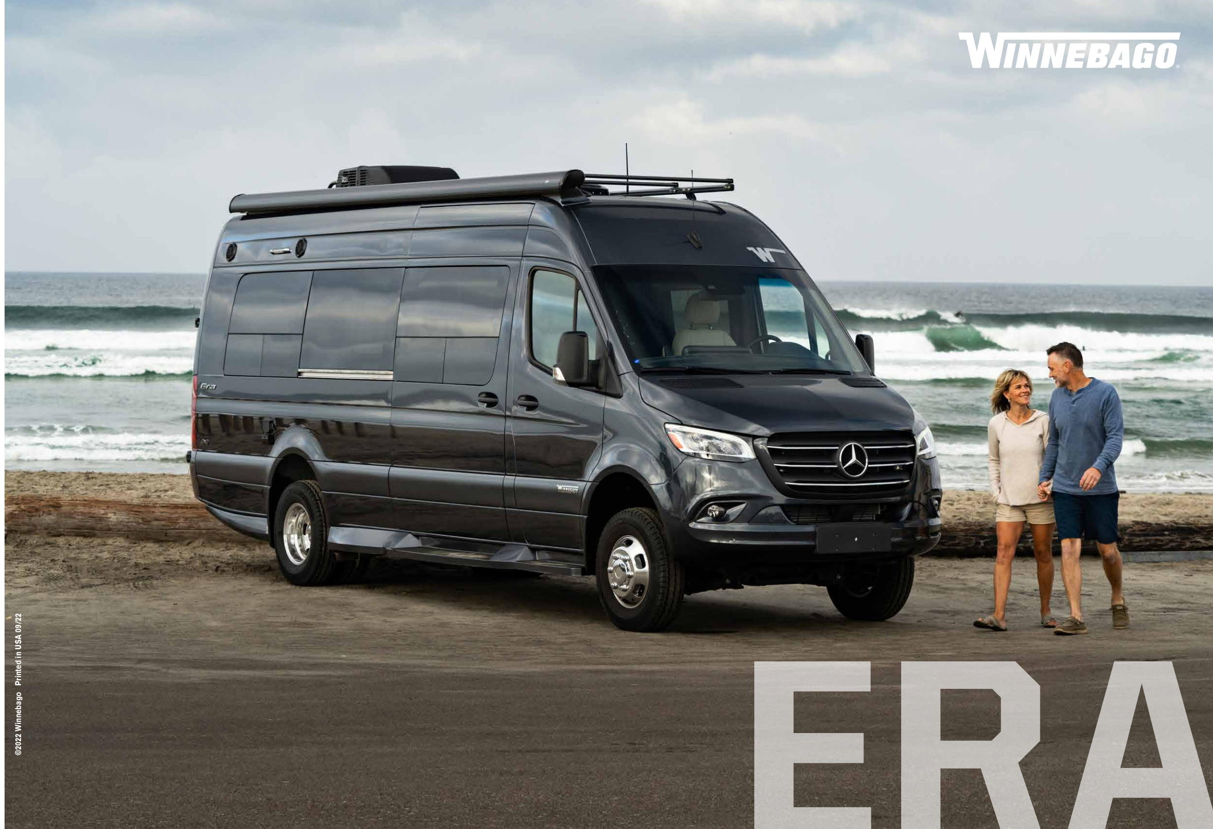
©2022 Winnebago. Printed in USA 09/22